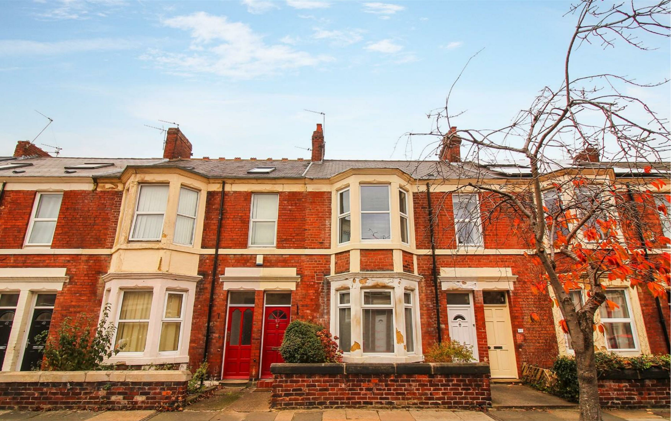
📍 Kelvin Grove, Newcastle Upon Tyne NE2 1RL